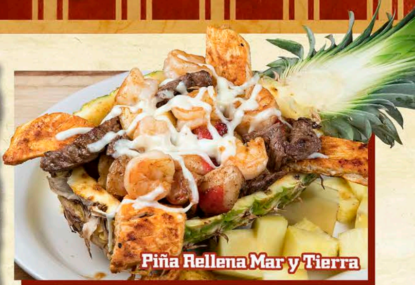
Piña Rellena Mar y Tierra

Carne asada, pollo loco, grilled shrimp and chorizo. Served over charro beans. Topped with Mexican onions and jalapeno peppers. Served in an authentic volcano stone dish. Choice of corn or flour tortillas. – 25.00